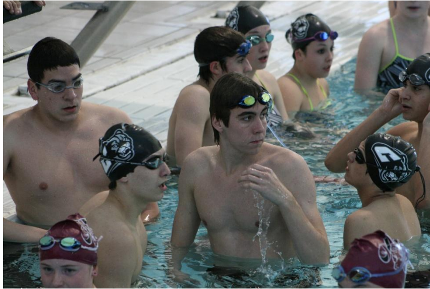
Cougars Gather to Warm Up for District Finals

The Clark Cougars endured a very long day on Saturday, January 22nd and succeeded in bringing home a lot of top places! From warm-ups that began at 7:30 am until the last finals race, which began at 8:25 p.m., Clark held strong with their eyes on the prize.