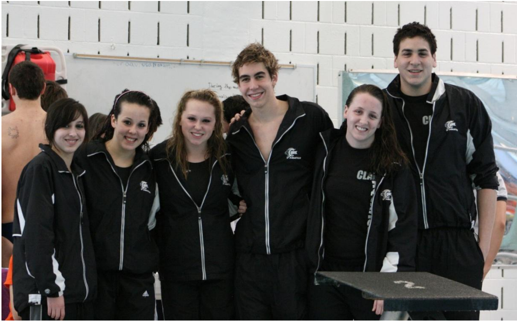
Clark 2011 Senior Swimmers