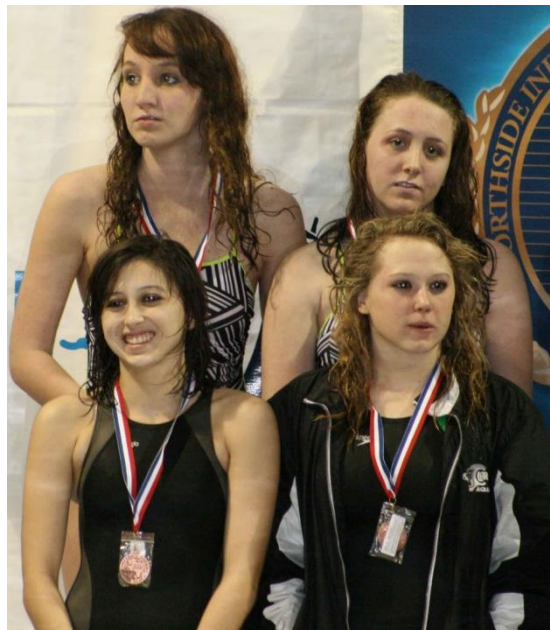
Women's 400 Relay Team District Bronze Medal Winners

The Clark women's squad, comprised of only 12 members, combined sheer guts, persistence, and stamina to bring home the 3rd place District 27-5A award.