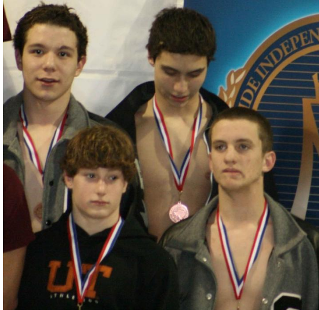
Men's Medley Relay Team District Bronze Medal Winners

Top finalists from Districts were back in the water the next week preparing for the UIL Region VII-5A meet February 4-5 at the Josh Davis Natatorium. But, surprise, San Antonio had a rare snow day on Friday, February 4th! With weather unpredictable on Saturday, the Region VII-5A meet was delayed until Monday and Tuesday, February 7-8. Prelims began at 9:30 a.m. on Monday the 7th and Finals began at 9:30 a.m. on Tuesday the 8th.